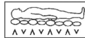
Phase 1/a mode