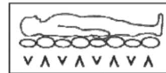
Phase 3/c mode