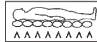
Phase 2/b mode